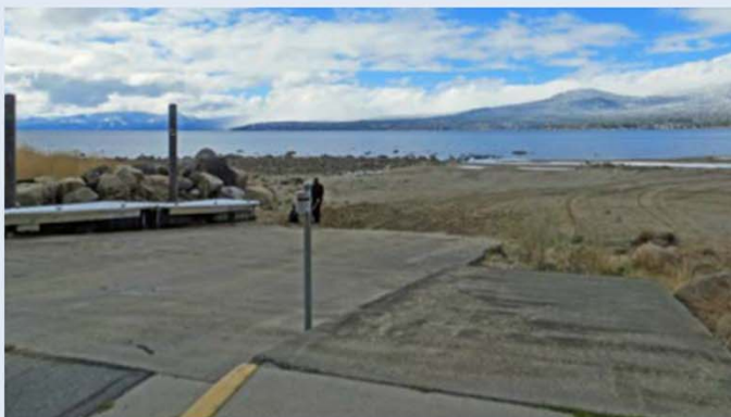
2015 boat ramp conditions