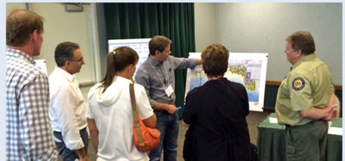
September 2016 public workshop